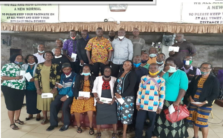
PASTORS OF WESTERN AREA WITH CASH GIFTS