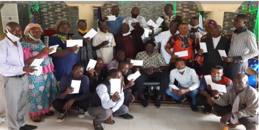
PASTORS OF NORTHERN REGION WITH CASH GIFTS