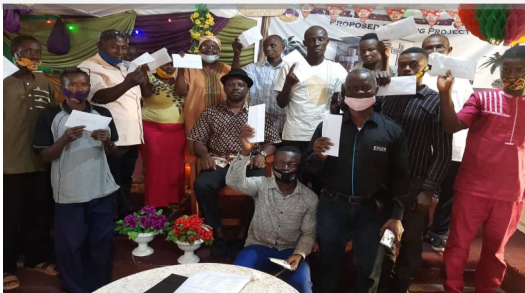
PASTORS OF SOUTHERN REGION WITH CASH GIFTS