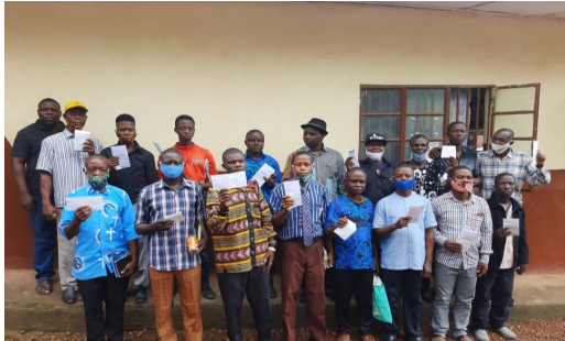
PASTORS OF EASTERN REGION WITH CASH GIFTS

Special thanks and appreciation to everyone that made this possible.