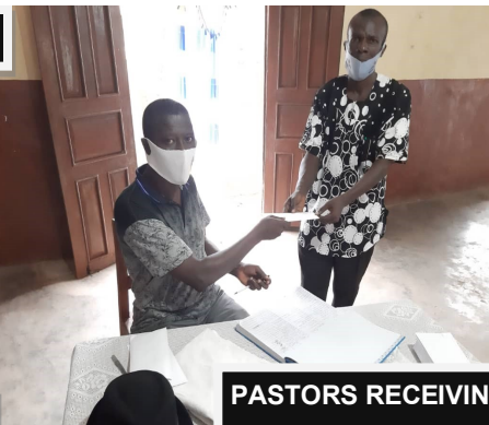
PASTORS RECEIVING & SIGNING FOR CASH GIFT