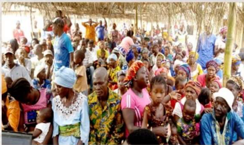
Villagers waiting to be seen by medical staff

with Bethel was so helpful in identifying what might be needed in other areas as Bethel replicates the medical mission model