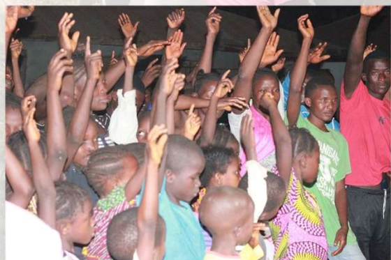
Villagers respond to an invitation to accept Christ during the showing of The Jesus Film

Pray that the Lord will continue to saturate Sierra Leone, and West Africa at large, with His presence and influence through the Gospel of Jesus Christ.