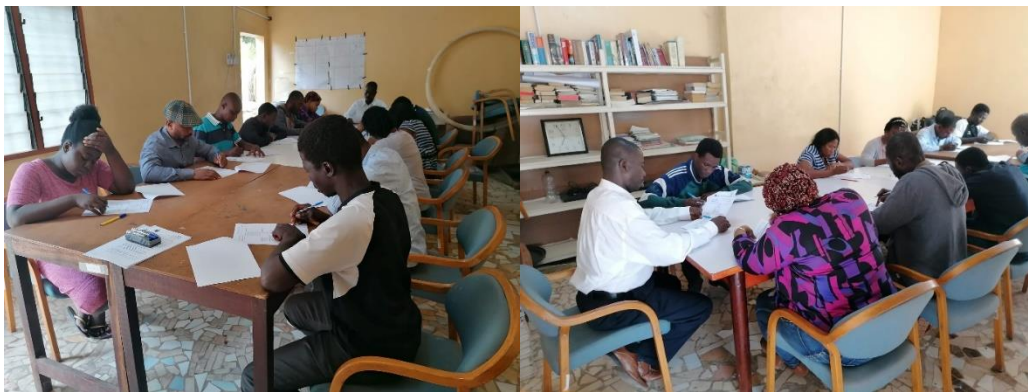
Students at the Fajara campus taking their 'Explore the Bible' exam in February.

The new term started in January 2022 with the Fajara campus hosting Explore the Bible and Discipleship training two evenings each week, and the residential Tubakuta campus hosting five full-time students. They have been studying: Acts, Isaiah & Mark's Gospel; Explore the Bible, How to Understand the Bible, Theology for Preachers, Discipleship, Principles of Preaching and having regular preaching practice opportunities.