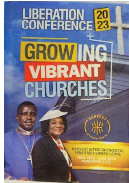
Pastors 2023 Conference in Freetown