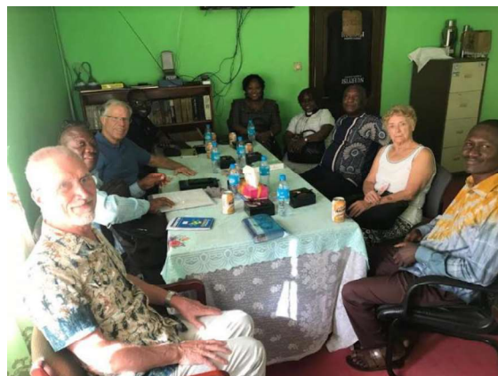
2023 SAVE team with SUSL leaders

Besides attending the 2023 Pastors Conference in Freetown, the SAVE team visited with partner ministries SUSL (Scripture Union of Sierra Leone) and DISCET (Diakonia Interdenominational Services for Counselling, Evangelism and Teaching).