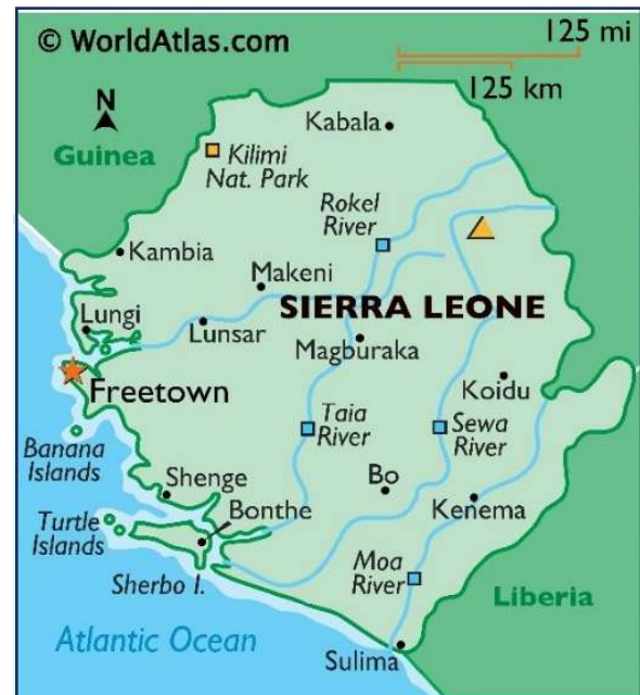
Major cities of Sierra Leone